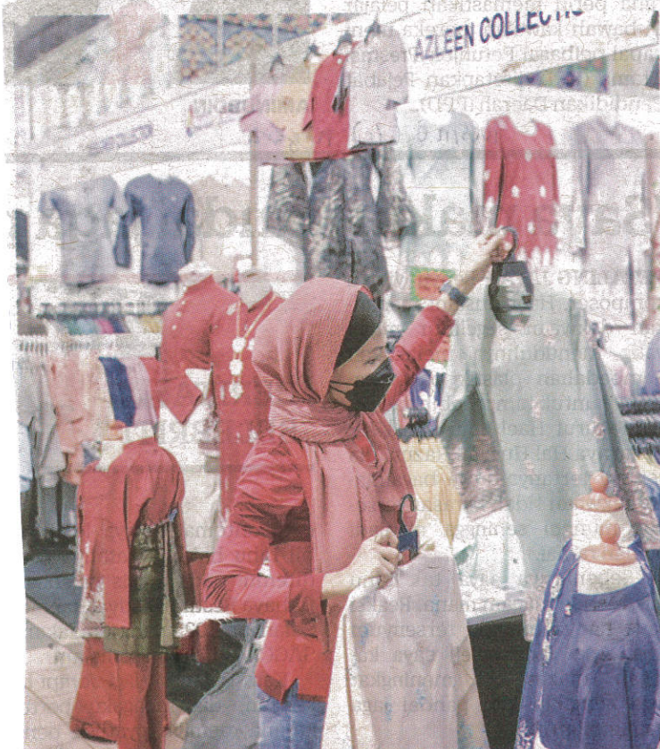
SEORANG peniaga sedang sibuk menyusun baju raya sebagai persiapan jualan menjelang Ramadan ini di Kompleks PKNS, Shah Alam, Selangor semalam. – ZULFADHLI ZAKI

Sebanyak 252,671 kes aktif dilaporkan melibatkan 244,262 kes dikuarantin di rumah, 1,453 kes di Pusat Kuarantin dan Rawatan Covid-19, 6,617 kes di hospital, 130 kes di Unit Rawatan Rapi (ICU) tanpa bantuan pernafasan dan 209 kes di ICU dengan bantuan pernafasan.