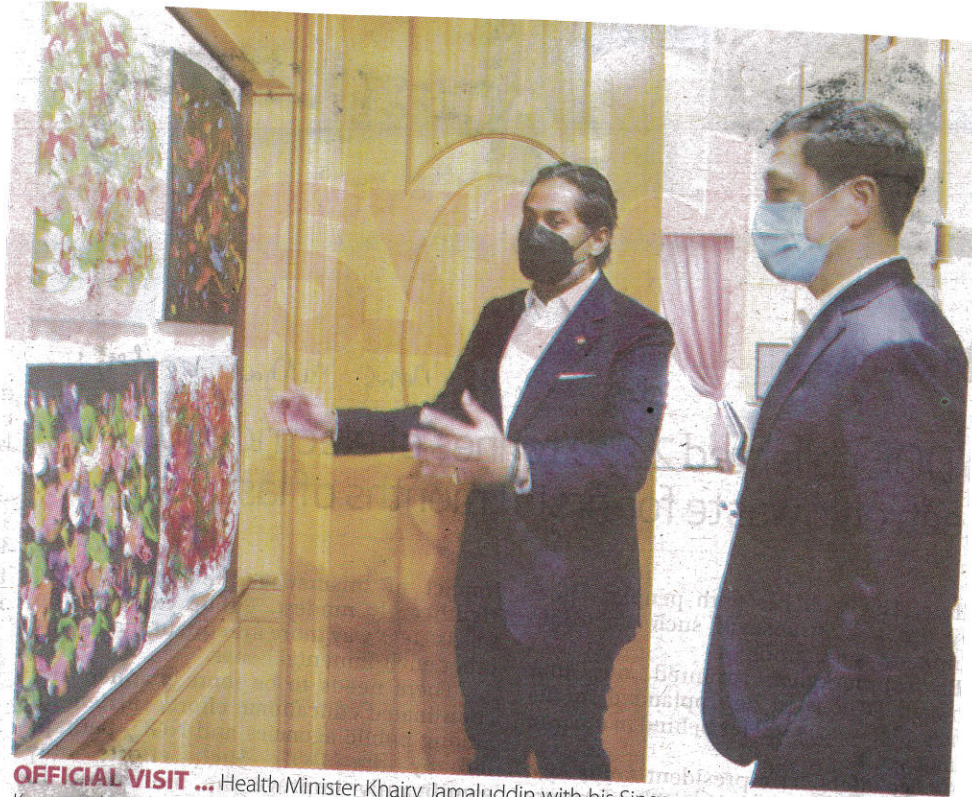
OFFICIAL VISIT... Health Minister Khairy Jamaluddin with his Singapore counterpart Ong Ye Kung at the Health Ministry in Putrajaya yesterday.