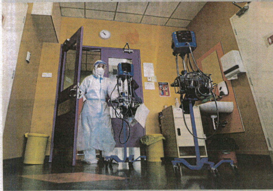
JURURAWAT membawa mesin bantuan penafasan untuk pesakit kanser yang dijangkiti Covid-19 di wad Covid-19 di Institut Kanser Negara (IKN) Putrajaya.