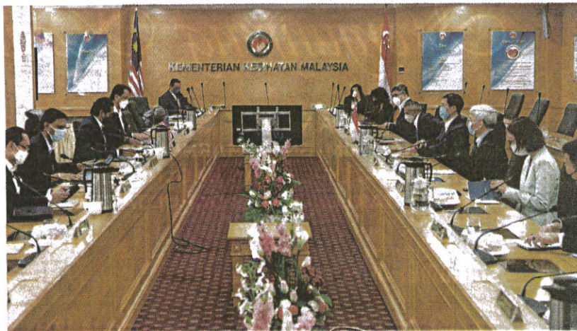
Khairy mengadakan mesyuarat dua hala bersama Ye Kung di Putrajaya, semalam.

"Menteri (Kesihatan Singapura) Ong Ye Kung dan saya mengadakan perbincangan yang